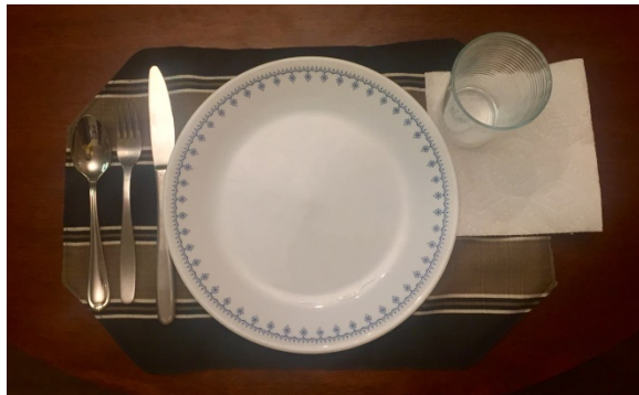
The table is set for Thanksgiving dinner!

full-grown turkey was large enough to feed a family.” This why turkey has been in the dinner table on thanksgiving.