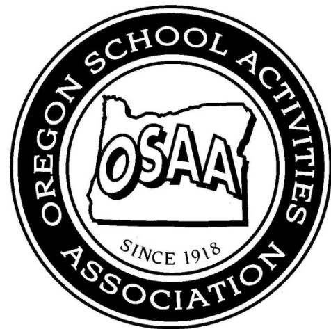
The official seal of the Oregon School Activities Association, taken from their website.

There you have it! Calculations, biases, and ratios. Visit www.OSAA.org to find your team/schools ranking!